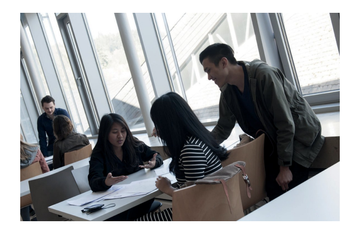
FACULTY OF ENGINEERING AND TECHNOLOGY

Cooperation agreements with many universities and third-level institutions worldwide, exchange programs at all levels complete our international profile. We are offering internationally accredited Bachelor's and Master's degrees.